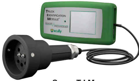
Super T.I.M. Reader/ Programmer Plug & Cable Connection

The Super T.I.M. increases Tank Truck safety with further automation of the loading and unloading process of Tank Trucks. Not only does the Super T.I.M. carry the typical Tank Truck ID number, it also contains a wealth of Tank Truck data to minimize fluid transfer errors and speed tank truck repairs.