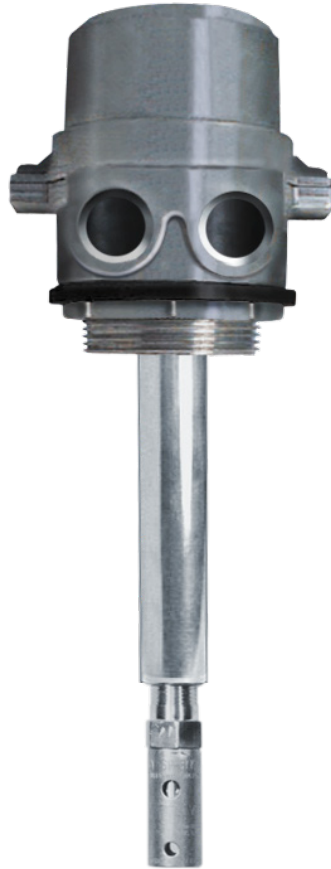
SP-BL / MHC

Featuring Dynacheck® – Automatic and Continuous Self-Checking Circuitry