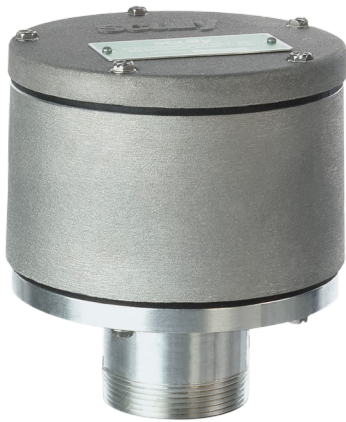
SP-H Holder (for 1-3 sensors)

Liquid Level Sensors For Storage Tanks and Other Fixed Applications