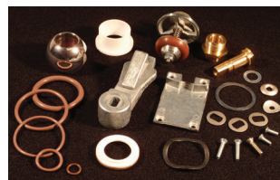
05416 Nozzle Rebuild Kit