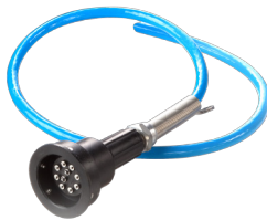
Poly Plug & Cable Assemblies