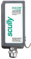
Sculcon Junction Box

Featuring Dynacheck® – Automatic and Continuous Self-Checking Circuitry