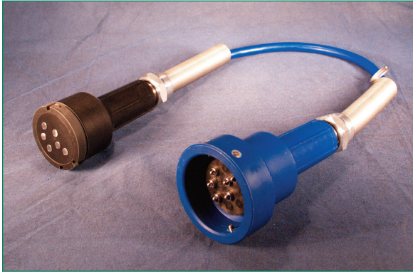
Scul-Gard Break-Away Cable

Featuring Dynacheck® – Automatic and Continuous Self-Checking Circuitry